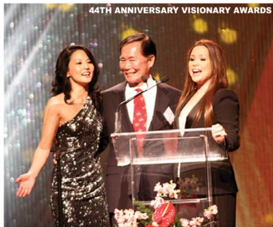
44TH ANNIVERSARY VISIONARY AWARDS SUBSCRIPTION PLAY 3 [ MAINLAND PREMIERE ]

Generous support for this production is provided by the S. Mark Taper Foundation Endowment for East West Players.