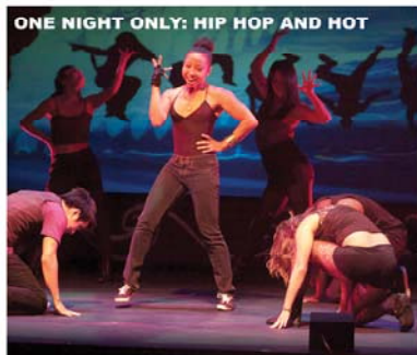
ONE NIGHT ONLY: HIP HOP AND HOT SUBSCRIPTION PLAY 2 [ LOS ANGELES PREMIERE ]

Deepa has been a widow for two years. Her only desire now is to see her daughter married so that she can die in peace. But when her recently divorced neighbor, also her son's best friend, professes his love for her, her inner-cougar emerges to break tradition and start living again. A smart and sexy comedy about creating new paths and reaching for the stars.