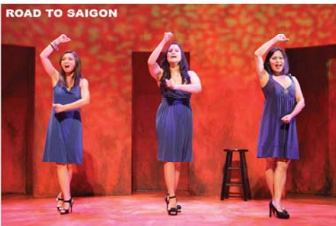
ROAD TO SAIGON SUBSCRIPTION PLAY 1 [ WORLD PREMIERE ]