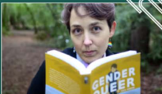
The 15 most banned books in America this school year

The 15 most banned books in America this school year - Los Angeles Times